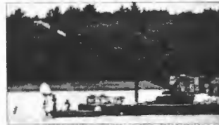
Crews release one-ton bags of oyster shells on a newly constructed reef Tuesday.